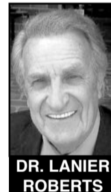
DR. LANIER ROBERTS Columnist

We certainly are living in trying times. What used to be right is now wrong, and what used to be wrong is now right in the world's eyes. It reminds me of the Old Testament scripture which states: "evil will be called good, and good will be called evil."