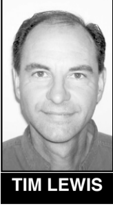
TIM LEWIS Columnist