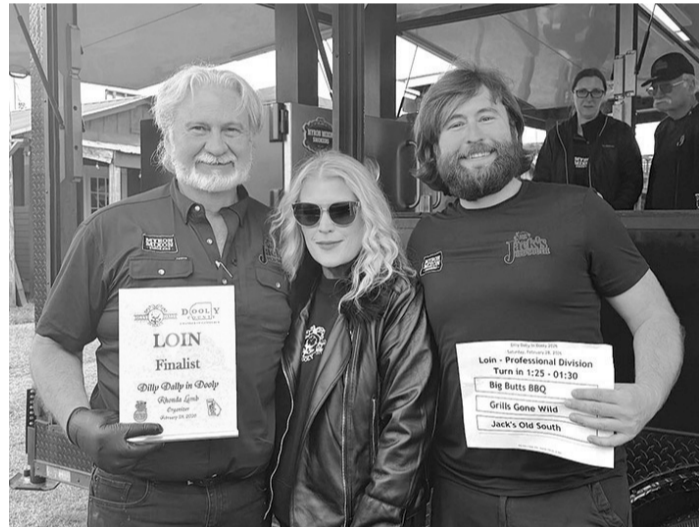
Jack's Old South

Looking ahead, the Dooly County Chamber is preparing for additional barbecue events in 2026 including Hogs for Housing, a Georgia Barbecue Association contest in late September, followed by the BIG PIG JIG®, a Memphis Barbecue Network contest held the first weekend in November. Plans are also underway for a GBA and Florida Barbecue Association dual contest in late 2027, the Ga.-Fl. Swine Bowl Dual BBQ Battle.