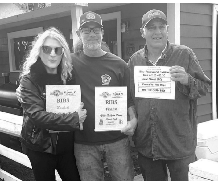
Vienna Volunteer Fire Department

The Chamber also expressed deep appreciation to its sponsors for their continued support, including: City of Unadilla; Albany Area Primary Health Care; City of Vienna; Georgia Power; Brannen Motors; Cadence Bank/Huntington Bank; Middle Georgia EMC; Wells Hardware and Wholesale Supply; Dooly County Sheriff's Office; Brannen-NeSmith Funeral Homes; Southern