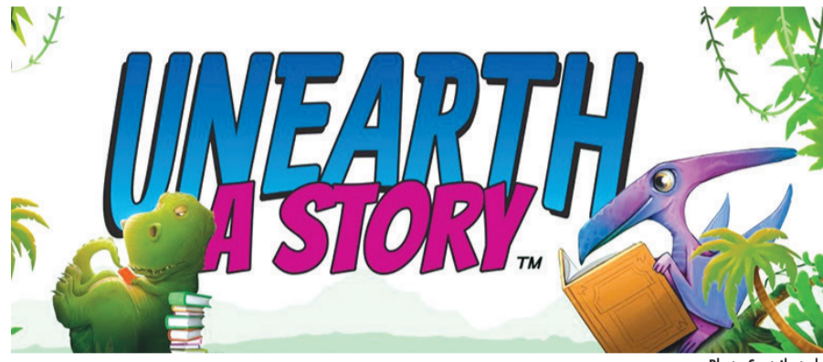
'Unearth A Story' will be the theme for this year's Summer Reading Program in Dooly.