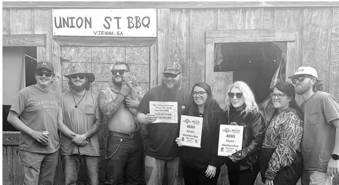
Union Street BBQ

And a very special thank you to Vienna Public Works for all that they do.