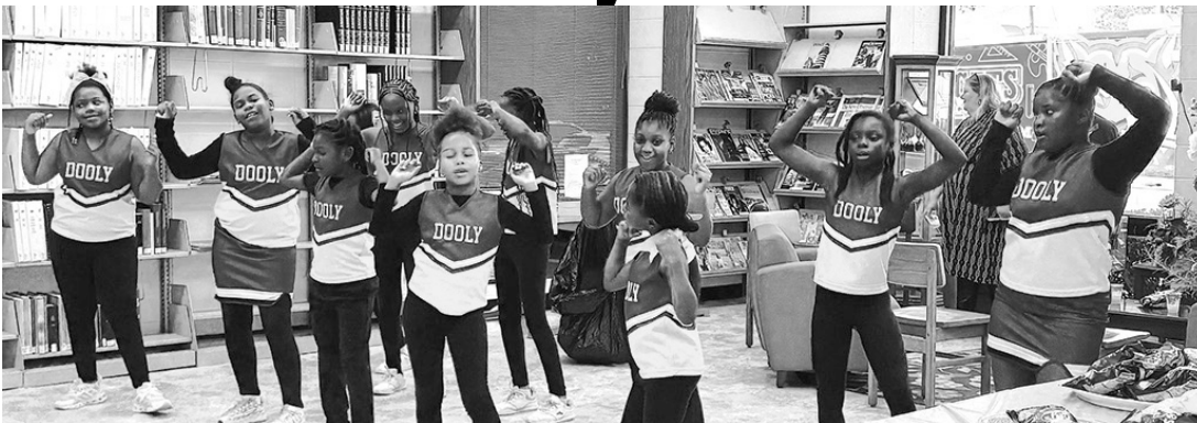
The Dooly County Recreation Department Cheerleaders entertained the crowd during the open house.