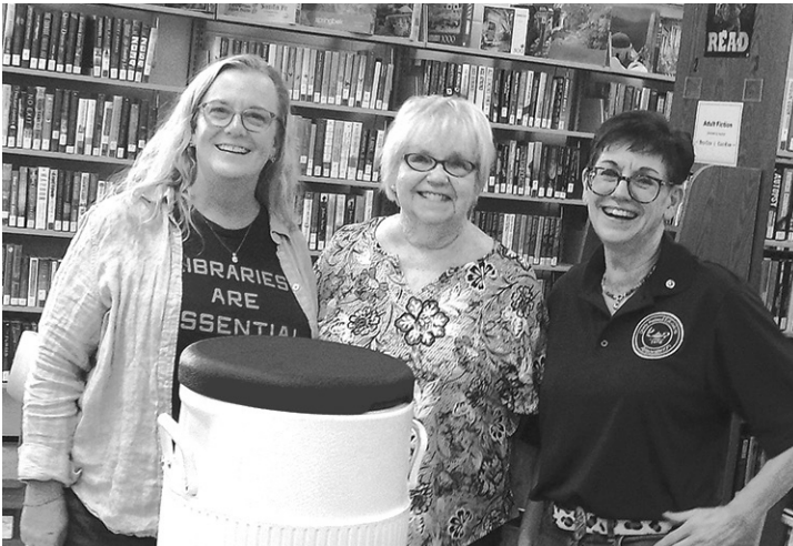
Refreshments were provided by the DREA, Dooly County Kiwanis and St. Paul Chapel.