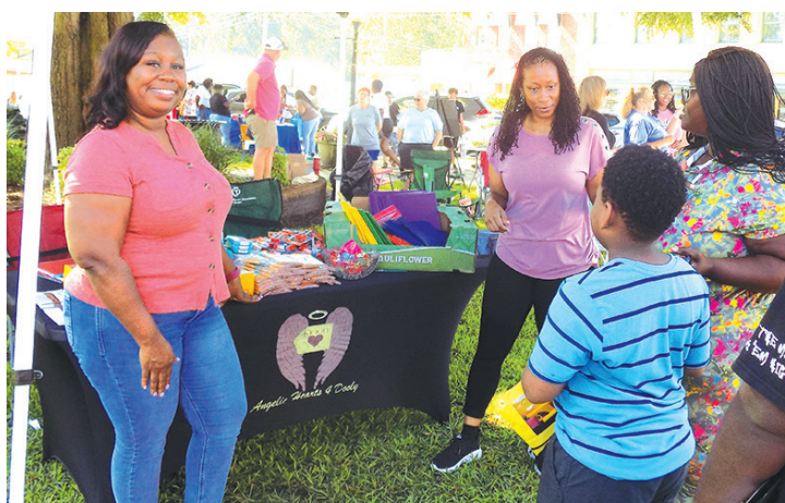
Angelic Hearts for Dooly.

and better serve the needs of local families. The survey link can be found on the City of Vienna's official Facebook page. As students prepare to head back to