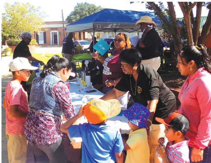
Dooly County Retired Educators.