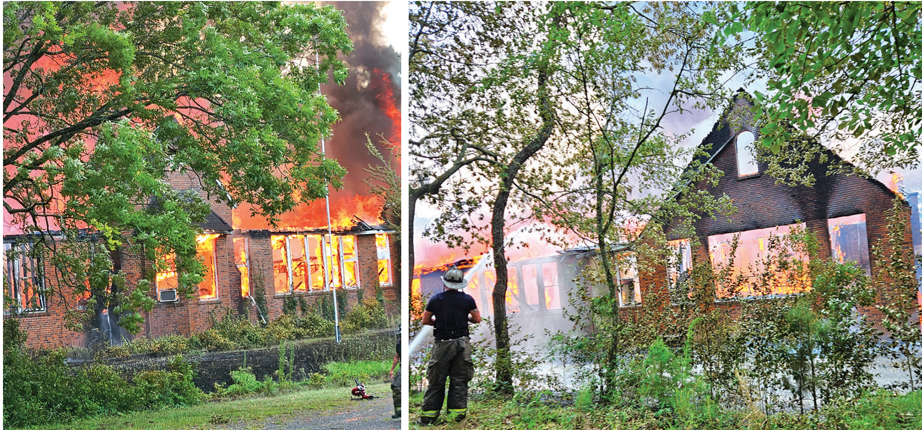
The old Vienna School / Jenkins School as it burned down last week while crews tried to put out the flames.