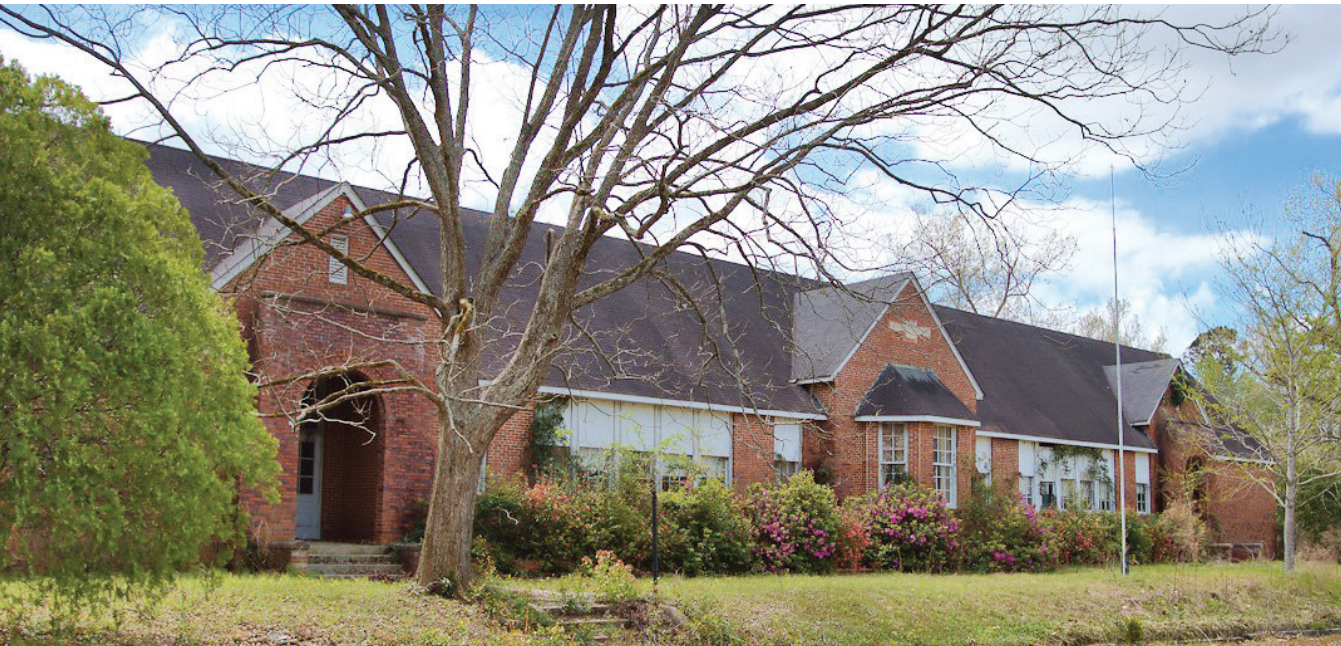
A picture of the Jenkins School before the fire.