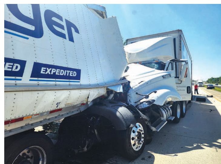
A second accident last Thursday involved five vehicles, two those being semis on I-75 mile marker 118. Three patients were injured, but none of those were believed to be serious.