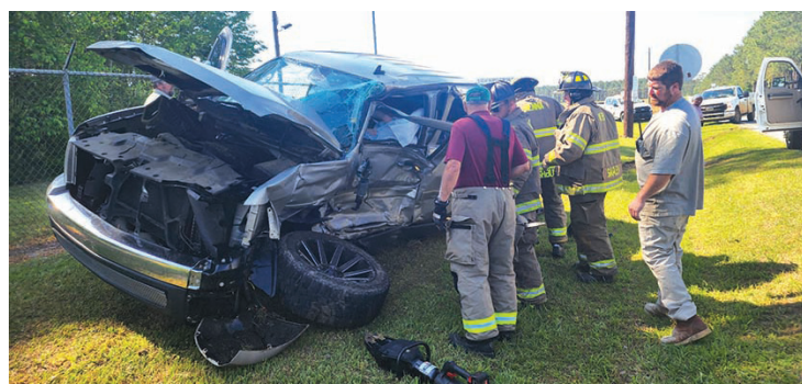
A local woman had to be extricated from this vehicle following an accident with a log truck last Thursday morning.

The vehicle also received significant damage to the driver's side. The investigation is still